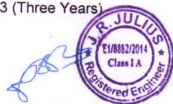
J.R.Julius District Panel Engineer

Certified that no addition or alteration has been made to the existing building or portion of the building for which this application has been made. I undertake to obtain fresh license, in case addition/alteration is made to the existing building or portion of the building. I also undertake to obtain fresh license, if the purpose for which the license was granted for the use of the building originally is changed or altered subsequently.